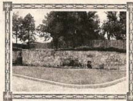
The "Big Spring" 13th and South Avenue