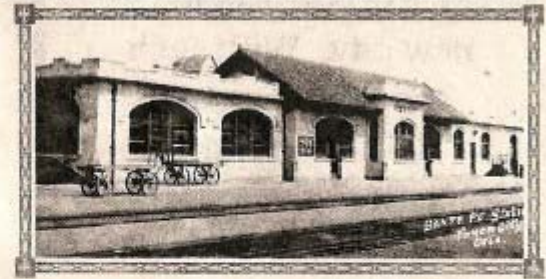
Santa Fe Railroad Station

Within weeks, frame structures, a school, a post office, and the Methodist Church were already being built. On December 19, 1893, the city was regularly incorporated and on February 2, 1894, the first official municipal election was held in which the offices of mayor, treasurer, clerk, and councilmen were elected.