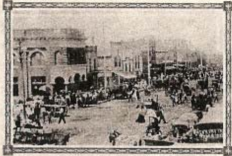
Corner of 2nd and Grand Avenue looking west