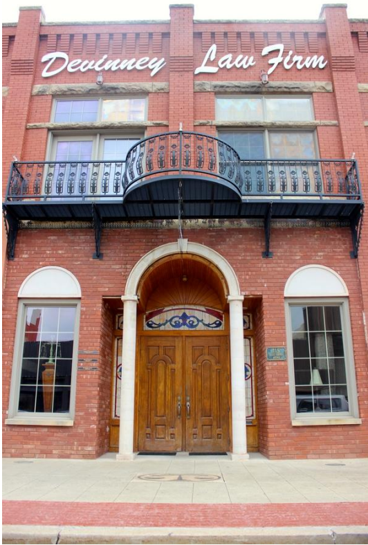
BEFORE - The doors are worn and scuffed and the upstairs windows need to be replaced.