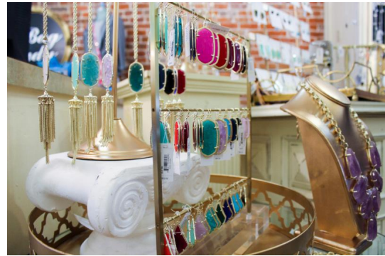
Just a few of the Kendra Scott pieces now on sale at The Bag Lady.

The Bag Lady Boutique hosted their Kendra Scott and Vera Bradley launch party on Thursday, March 10. These two unique and popular brands are new to the boutique, with the Bag Lady being the only place in Ponca City to sell Kendra Scott items. The launch party was wildly successful with many regular clients making it in to check out all the new items.