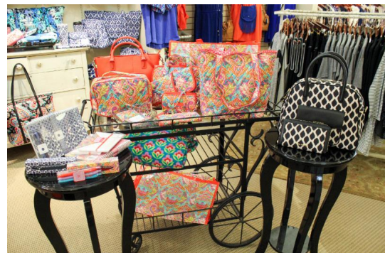
Bright colors and beautiful patterns are a trademark of the Vera Bradley brand.

Vera Bradley boasts that their story is a testament to the American Dream. According to their website, the founders noticed a definite lack of feminine looking luggage while at the airport. Within weeks, the women had created a company capable of marketing and manufacturing their cleverly designed products. The demand for these unique handbags and luggage items has now grown so popular that it is nationally and internationally recognized.